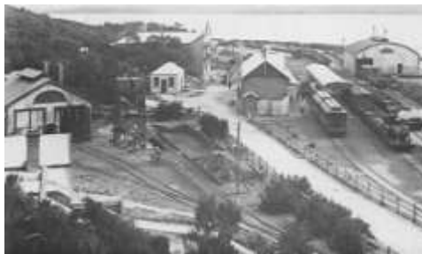
Figure 17 Regatta Point c1930 showing Loco Shed on left and Station (Archives of Tasmania)